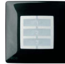
▶ OPLA ULTRA COMPACT WALL MOUNTED RADIO TRANSMITTER