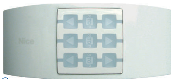
◀ ONDO MAGNETIC WALL FIXING AND TABLE TOP RADIO TRANSMITTER