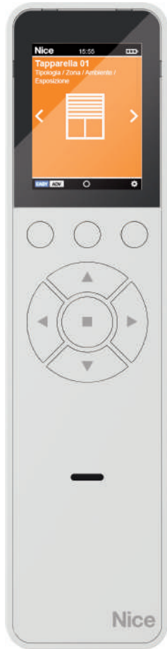
◀ ERA-P VIEW MULTIFUNCTION RADIO TRANSMITTER WITH GRAPHIC INTERFACE