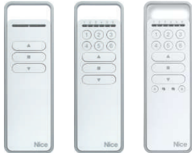
ERA P1 ERA P6 ERA P18