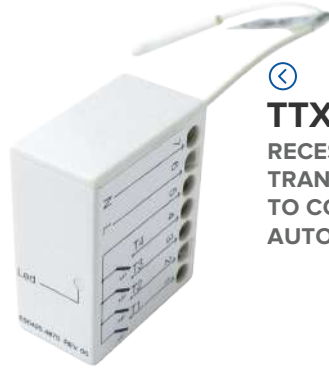
◀ TTX4 / TTXB4 RECESSED TRANSMITTERS TO CONTROL AUTOMATIONS