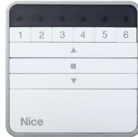
◀ ERA W SERIES WALL MOUNTED RADIO TRANSMITTER