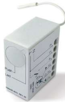
▶ TT2N RADIO RECEIVER AND RECESSED CONTROL UNIT TO CONTROL ONE 230 VAC MOTOR